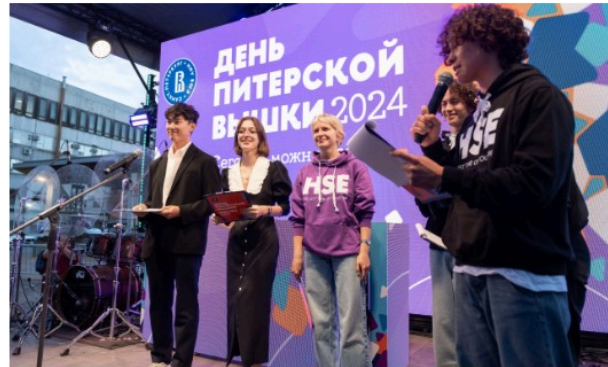
HSE Spb Day