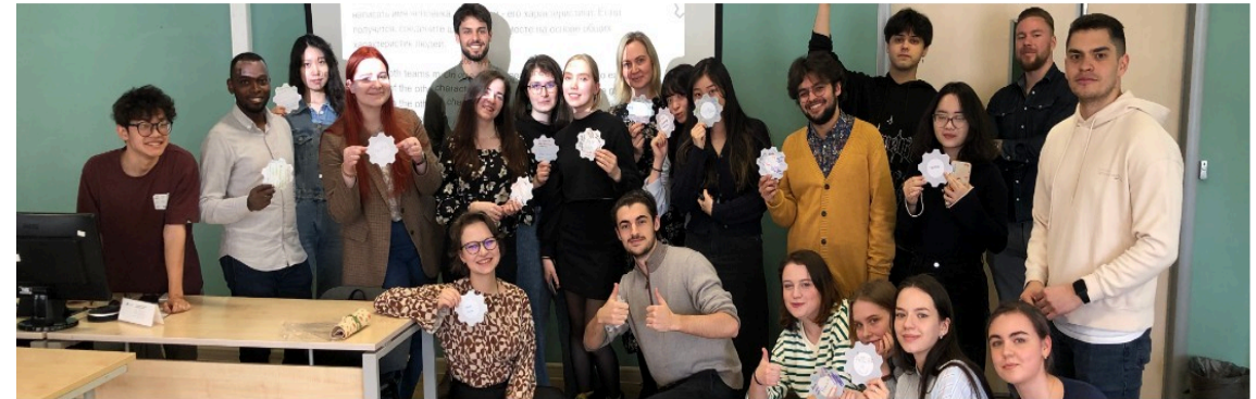
Language Lab Club