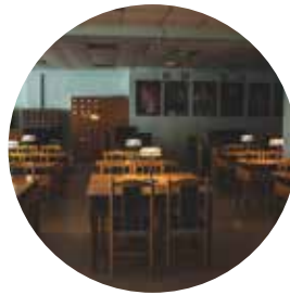
LIBRARY AND INFORMATION CENTER