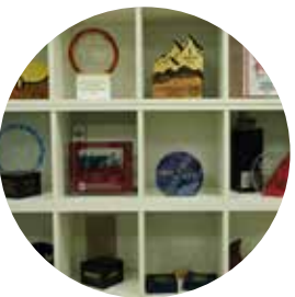
PROTOTYPING AND MOCK-UP CENTER