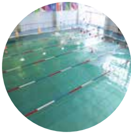
FITNESS AND RECREATION CENTER WITH A SWIMMING POOL