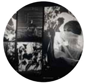
PHOTOGRAPHIC ART LAB