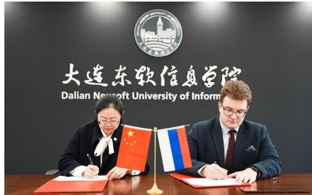
Signing Ceremony of Double Degree Agreement with Dalian NEUSOFT University of Informatics (PRC)