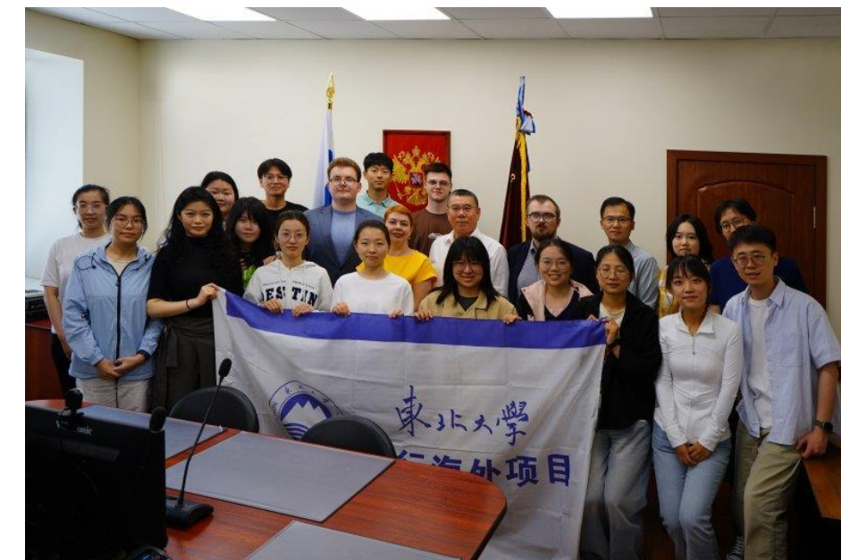
Launch of Summer School in Land Planning and Land Management for the students and faculty members of the Northeastern University (PRC)