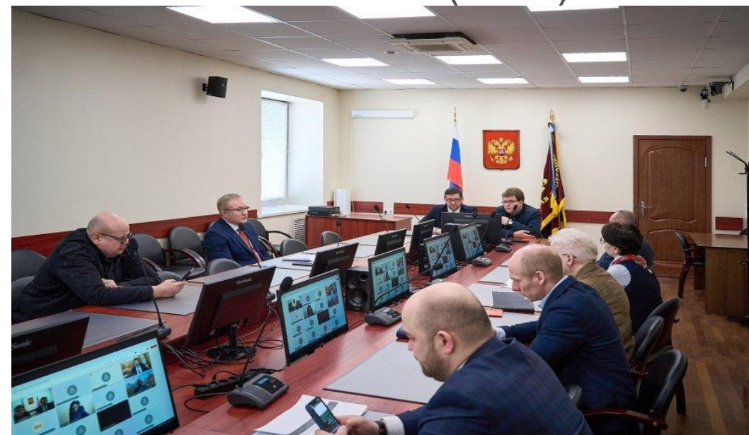
Meeting with the Ministry of Education of Ethiopia and universities' leaders