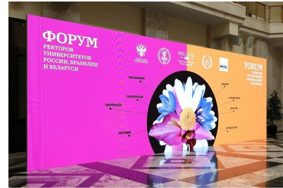
Joining the League of Belorussian, Brazil and Russian Universities